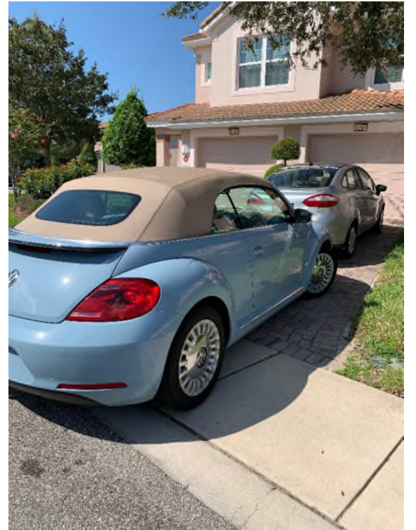
2 Cars in Driveway