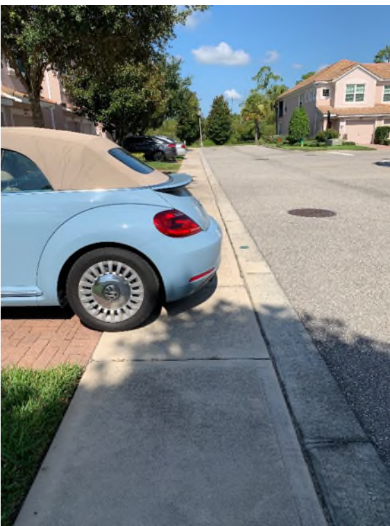
Overhanging on sidewalk