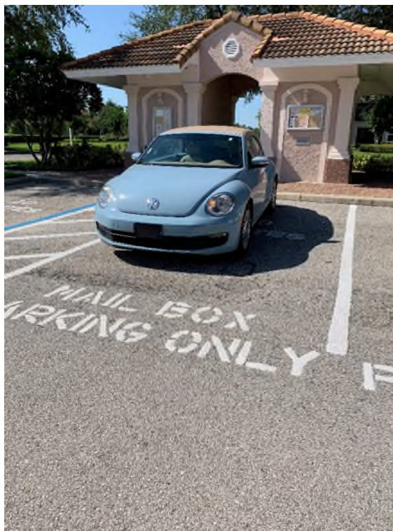
Parked at mailboxes longer than 10 minutes