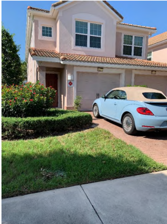
Non Owner in Owner Driveway