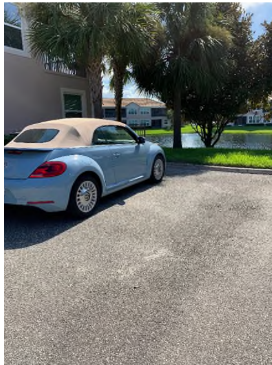
Dead End Parking